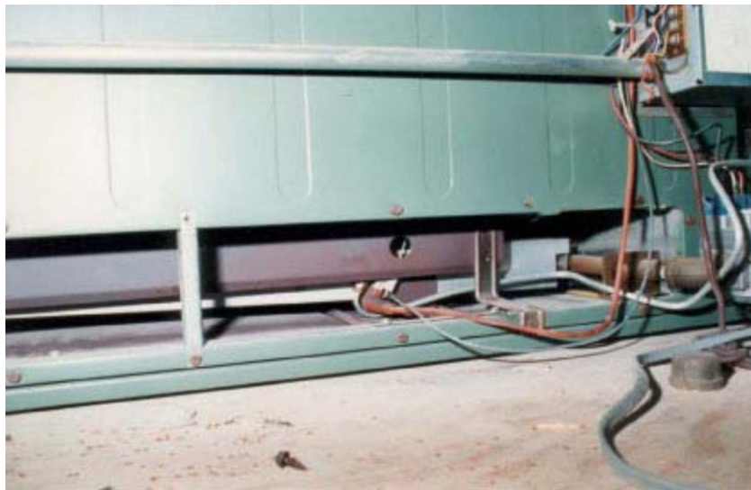
Photo Two: Combustion air intake port at bottom edge of furnace housing.