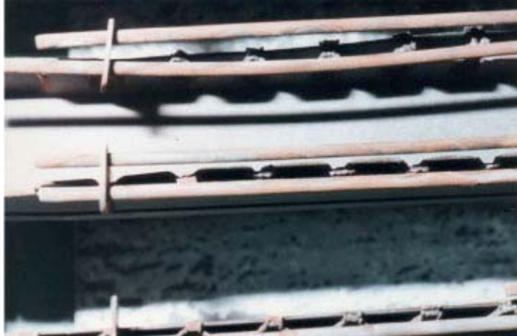
Photo Three: Close up view of cracks in the web between burner port openings resulting in the enlargement of the port openings.