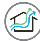
Heating & Air